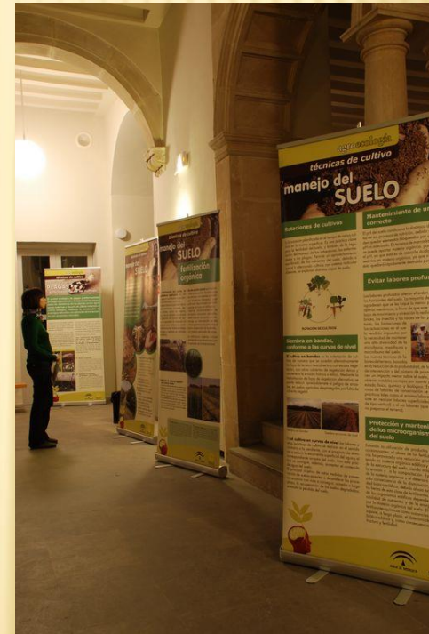
Exhibition of Agroecology panels in University of A Machado (UNIA) in Jaén 2008