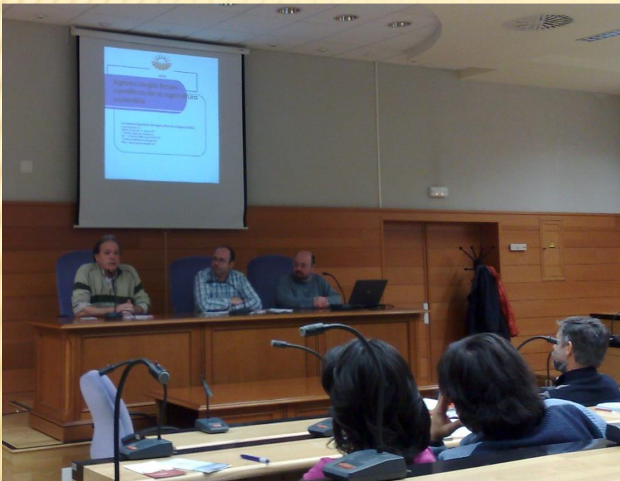
Seminary of Agroecology in University of Jaen 2008